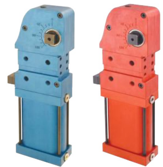
Red or Blue colour options